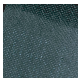
Cordura® After 3,000 cycles

Most external panels benefit from the toughness of Cordura®, a high-performance, super-durable fabric that is perfect for the demands divers place on their equipment. It's resistant to abrasions, tears, and scuffs--all the qualities you expect from a high performance fabric.